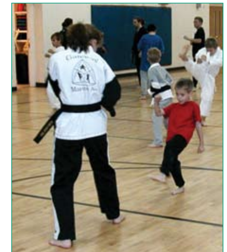
Perfect for ages.