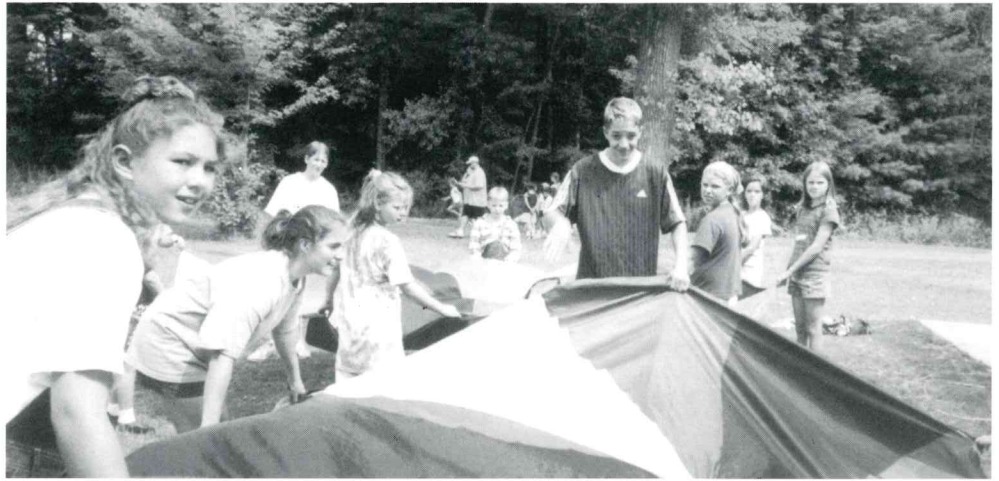
Teamwork is the order of the day as these Summer Program students open a gigantic parachute for fun and games.