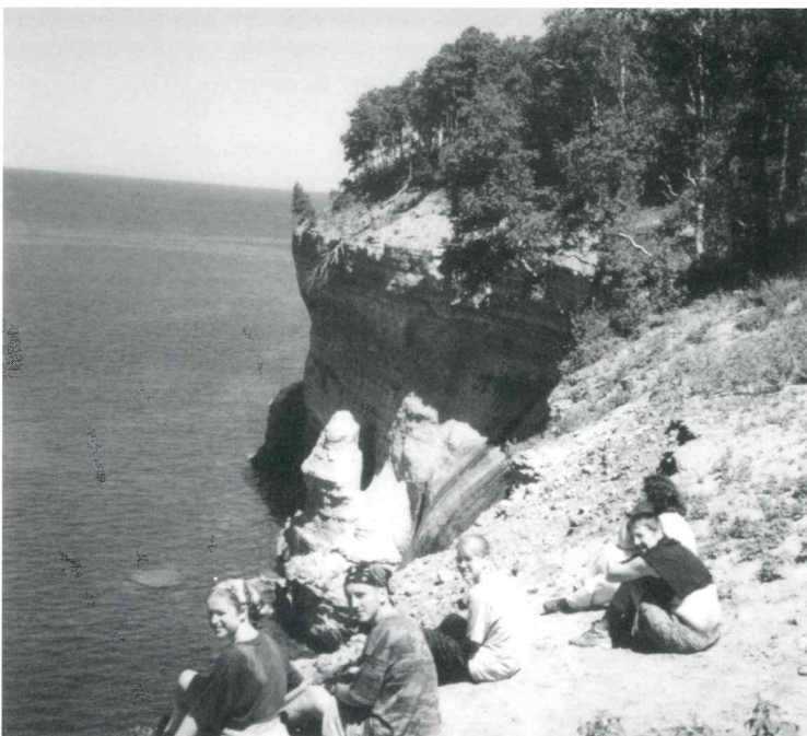
COP students enjoy an impressive view of Pictured Rocks Lakeshore.

A farewell dinner August 5 marked the end of another successful year as students said their good-byes before departing for their prospective colleges within a few weeks.