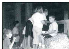
Look...in here, it's a cow!

This summer as in previous summers Chippewa Nature Center and WMFC came together to provide WMFC summer program participants a summertime Grand Finale. But this year things were different. This year's collaboration didn't just provide a finale but filtrated through all aspects of summer program, making for a wonderful outdoor adventure for all involved.