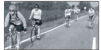
COP students heading east on their 270 mile journey across the state.

many people—sisters in matching custom-made jerseys, people with stuffed cows on their helmets, recumbent riders with whirligigs flying behind them. Everywhere there were people smiling! It was a carnival to which the COP students quickly acclimated.