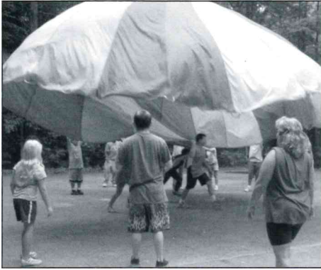
Parachuting at Neyati.

In the spring of 2006, Shelterhouse and WMFC were awarded a United Way Women's Initiative grant, which among other things supported a weekend family retreat for mothers and their children "Camp Retreat and Rebuild."