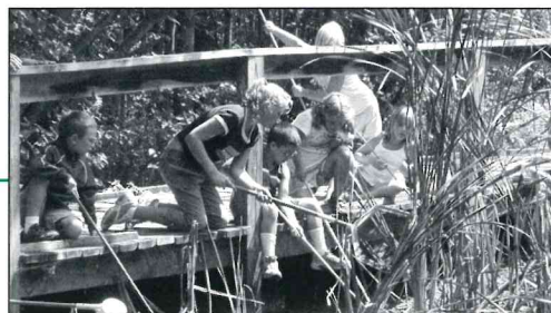
Nothing more fun than froggin.'

were found and provided by nature. Dressed in 1870's attire our kids could easily have been mistaken for children of another era: learning ~ having fun, gaining respect for the out of doors with activities of a bygone age.