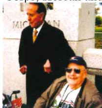
Charles meets Former Senator Bob Dole

In 1943, at the age of 20, Dow Chemical Employee Charles Cochran entered the