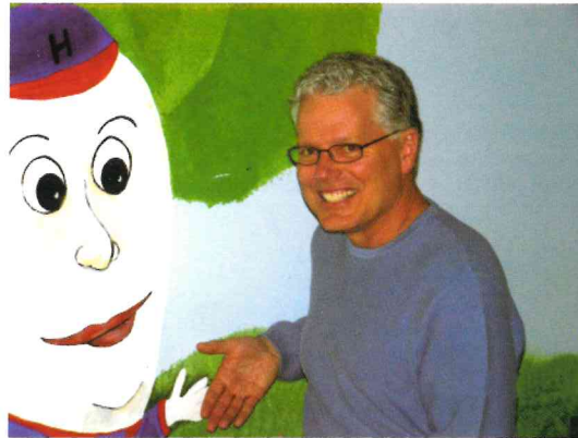
Humpty practices reaching out to a stranger.

that truly random act of kindness that takes no justification. "With love from the U.P." is about a young couple that many years ago pulled up to the tollbooth on the Mackinaw Bridge only to be told that the previous car had paid their toll. They were so touched that to this very day they always pay the toll of the car behind them. The first donor car had no idea if the second car needed any help. It didn't matter. The end result is that one simple act of charity has been repeated over and over again and probably picked up by additional grateful motorists.