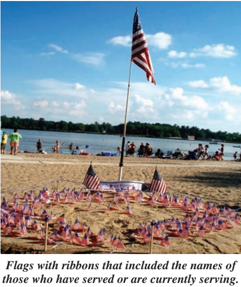
Flags with ribbons that included the names of those who have served or are currently serving.

Parkapalooza is a fun filled annual end of the summer family event at Sanford Lake Park that is sponsored by the Midland County Parks and Recreation Department. Parkapalooza features different community organizations sponsoring family activities as well as a number of different bands that play music from a beachside stage throughout the day. This year WMFC staff members contributed to the fun event by providing wholesome family activities which included "Make it Take It" crafts, family games, a Spiderman Bounce House and a large inflatable obstacle course.