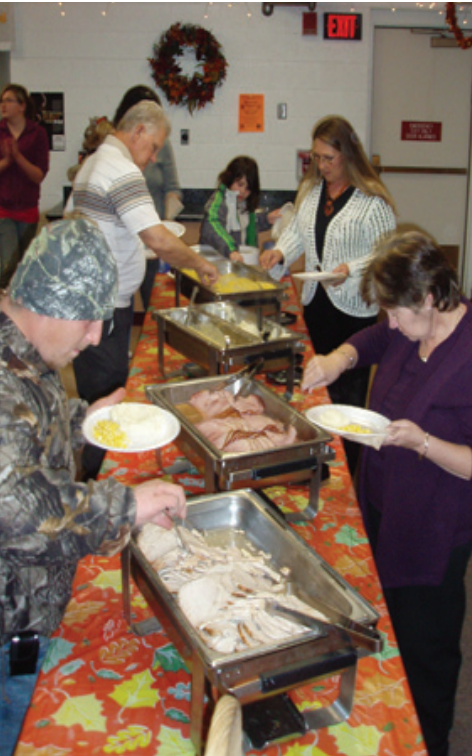
There is something for everyone at our Thanks For Giving Celebration.

This year WMFC's Thanks for Giving Celebration , will be held on Thursday, November 17, 2011 from 5:30-7:30 p.m. This annual event was established as a tribute to, and celebration of, our volunteers, donors and all those who play an integral role at the Center, including the families we serve. Thanks for Giving Celebration is a fitting start to the holiday season. This year's event will take place during National Family Week . In the past, National Family Week was celebrated at three different sites throughout Midland County. This year all involved Midland County non-profit organizations will combine their efforts and celebrate National Family Week at the West Midland Family Center as part of WMFC's Thanks for Giving Celebration . The evening will begin with a ceremony to recognize the special volunteers that have demonstrated extraordinary commitment to furthering the WMFC mis-