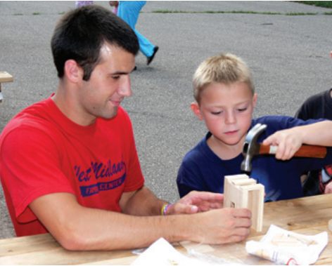
West Midland Family Center... Always Making The Difference.