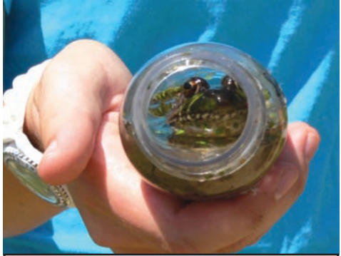
Children put the most unique things into their backpacks to take home at the end of the day! One group leader rescued this frog who was headed home with a child! Consensus was that the frog was happy to be returned to his own family in the creek!