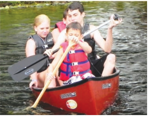
Canoeing was a family favorite at Family Camp.