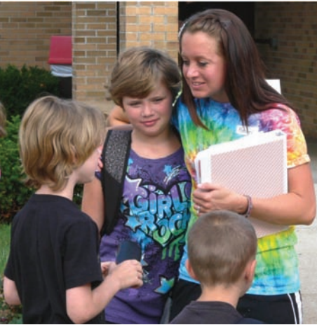
West Midland Family Center... Always Making The Difference.