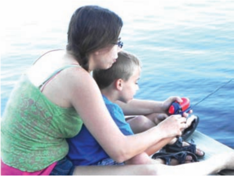
When asked “What was the best part of family camp”, many children and parents alike responded, “Spending time together...”

The WMFC staff planned many activities and special events for the families including family scavenger hunts, fishing, boating, crafts, building “family cars”, family games, swimming, bonfires complete with S’mores and a “Drive in Movie” lakeside. Special collaborations with North Midland Family Center and Jeff Myers from Black Creek Sportsman’s Club, allowed for instruction in archery and marksmanship. In addition, MSU Extension hosted a Camp Neyati version of the Food Network Channel’s “Chopped”.