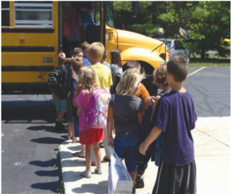
Another summer at WMFC comes to an end.

VOLUME 23, NUMBER 1 • P.O. Box 1985 • Midland, MI 48641-1985 • www.wmfc.org • (989) 832-3256 • Summer 2012