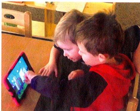
Midland Rotary Foundation recently purchased iPads for all WMFC Preschool Classrooms