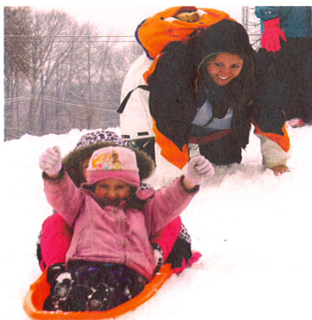
West Midland Family Center... always making a difference