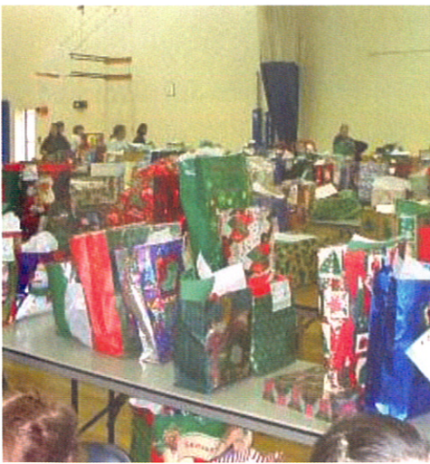
Sharing Tree Gifts Bring Smiles to 587 Faces