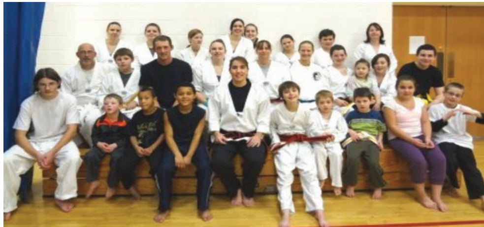
WMFC Gateway Martial Arts Class

In 2002 Gateway Martial Arts approached the West Midland Family Center about the possibility of a partnership that would involve offering free adult and children's martial arts classes. Twelve years later that program, is staffed completely by volunteers, and is still going strong.