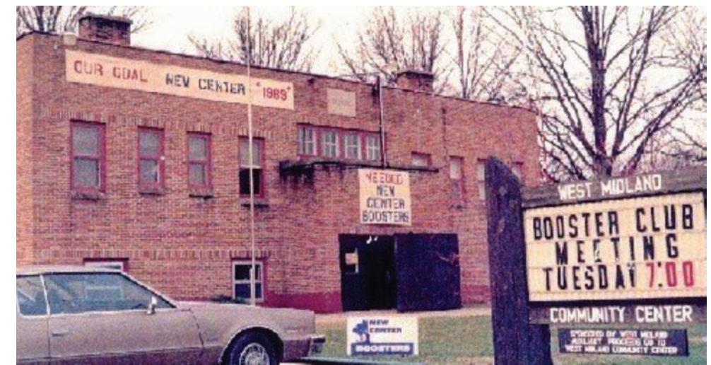
The old Greendale School...home to WMFC for 19 years