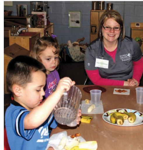
Snack time is learning time!