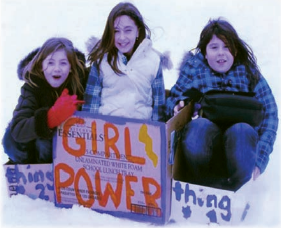
West Midland Family Center... Always Making The Difference.

NONPROFIT U.S. POSTAGE PAID MIDLAND, MI PERMIT NO. 153