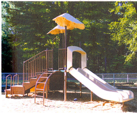
Completed Play Structure

classroom, providing scholarships and the need for a playground for the youngest children at the Center.