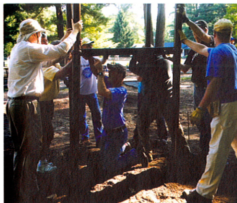
Volunteers and WMFC staff work together to make “dream” playground a reality at WMFC.

In mid-July Phase 1 of the two-year project began. WMFC staff members moved and unwrapped the structure