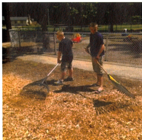
Middle School Students making a safer playground.

The first project that the teens devoted themselves to was readying