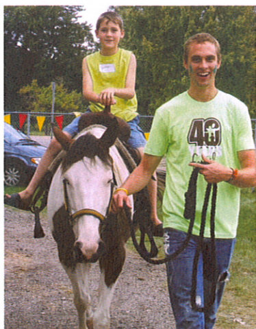
West Midland Family Center... always making a difference