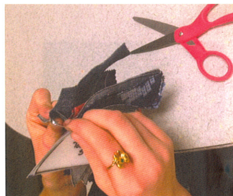
Denim fabric was cut to provide 45 pairs of shoes for the children of Uganda.

“It felt good to help animals that don’t get what they need.”