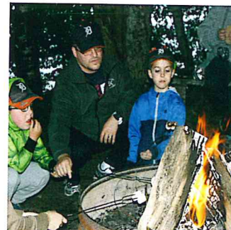
Campfires and smores are favorite WMFC Family Camp Neyati memories!

really make a difference in the lives of those we serve? In a thank-you note, one parent wrote: "Thank you so very much for the opportunity to participate in Camp Neyati. It was very obvious how much time and effort goes into creating a memorable time for families, and that is what you have done. Everything was free, we received prizes, meals and got to participate in family-oriented activities. We all had a great time and will keep the memories forever!"