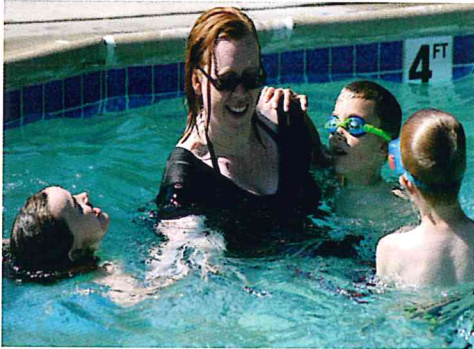
Swimming with your group leader is always a highlight

projects to the 3rd through 5th grade and middle school students. Along with all the fun they had building bridges, catapults and bottle rockets, the children acquired knowledge of potential and kinetic energy, they