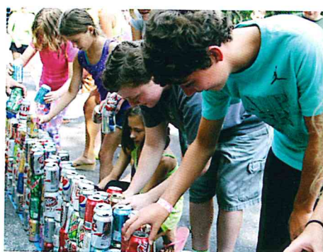
Stacking cans in pursuit of the Unofficial Pop Can Wall World Record!

The first ever Unofficial World Record Pop Can Wall Event was the culmination of a pop can drive to support student trips. Dow COP students collected, sorted, and washed cans for the event. The WMFC Summer Program students developed engineering skills as they devised ways to build