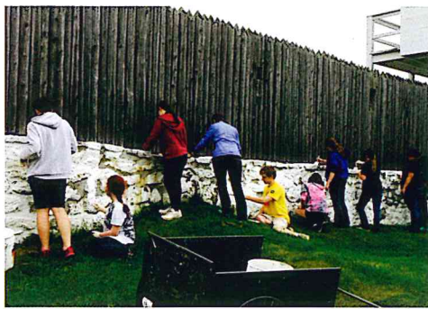
15 Dow COP students paint Fort Mackinac