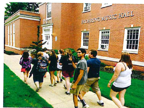
The Dow COP Juniors pass by Frohring Music Hall during a recent tour of Hiram College.

The Dow College Opportunity Program (Dow COP) helps enrich students' lives while helping students prepare for college during their high school years. In July, the Class of 2016 visited colleges on their junior class college tour trip. They met with