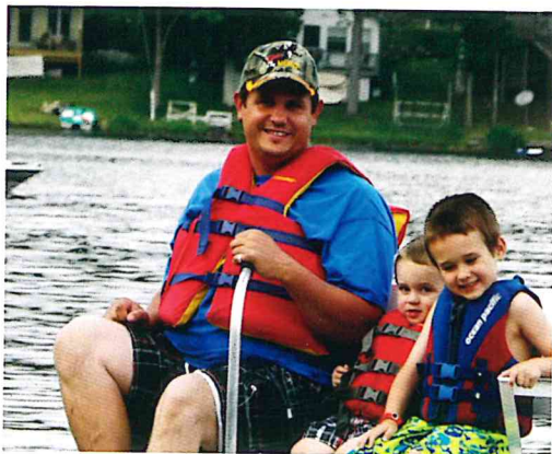
Boating and fishing at WMFC Family Camp Neyati are highlights of the camp experience!