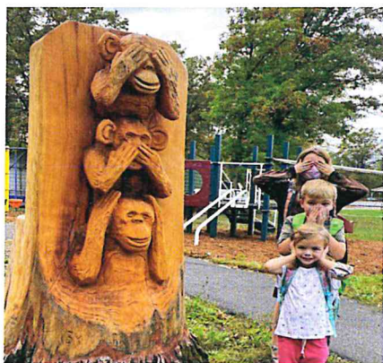
Ooh, ooh....Monkey see, Monkey do