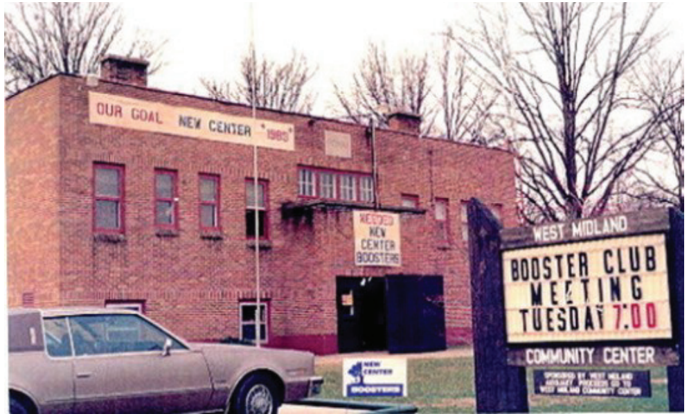
The former Greendale School #4 served well as the Center from 1974-1989.

Live music, food, swimming, games and activities for all ages will showcase the amazing facilities and grounds WMFC has to offer the community. Please mark your calendars and join us on Thursday, July 25th when we celebrate 50 years of thriving, giving and growing together.