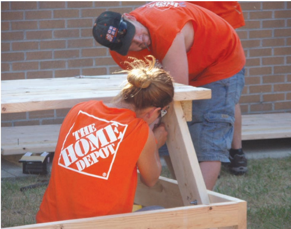
Home Depot Team Members Assembling One of Fifty Picnic Tables